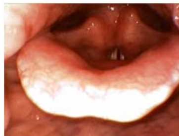
Plate 1: Shape of the laryngeal inlet during kulning.

Plate 1 and Plate 2 illustrate the hypopharyngeal and laryngeal structures in kulning and falsetto, respectively. The low pharynx and the laryngeal inlet are narrowed in kulning compared to falsetto. In kulning the base of the epiglottis is pulled backwards together with an approximation of the ventricular folds and the anterior posterior laryngeal distance, which obstructs visualization of anterior part of the vocal folds.