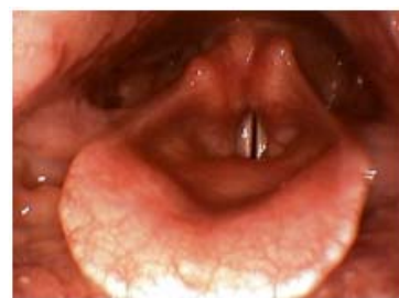
Plate 2: Shape of the laryngeal inlet during falsetto.